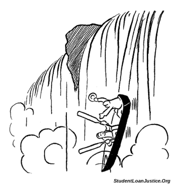
efore the pandemic, the Brookings Institute <u>estimated</u> that student loan defaults for the Class of 2004 would reach 40%. This is more than double the default rate for subprime home mortgages of less than 20%. These borrowers, however, were borrowing less than a third (roughly $13,000) of what is borrowed today (roughly $39,000). Wages have not tripled since 2004. They have flatlined with inflation, at best. Given this, it should not be controversial to say that defaults for all current student loan borrowers were going to be at least 60–70% (if not higher)...before the pandemic.

The student loan "apocalypse" has already happened- more than two years ago. The pandemic is the nail in it's coffin. There is no saving it, and there is no good reason to save it.